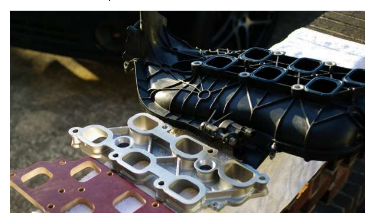
Below is a layout of the Manifold Insulators & disassembled Manifold.